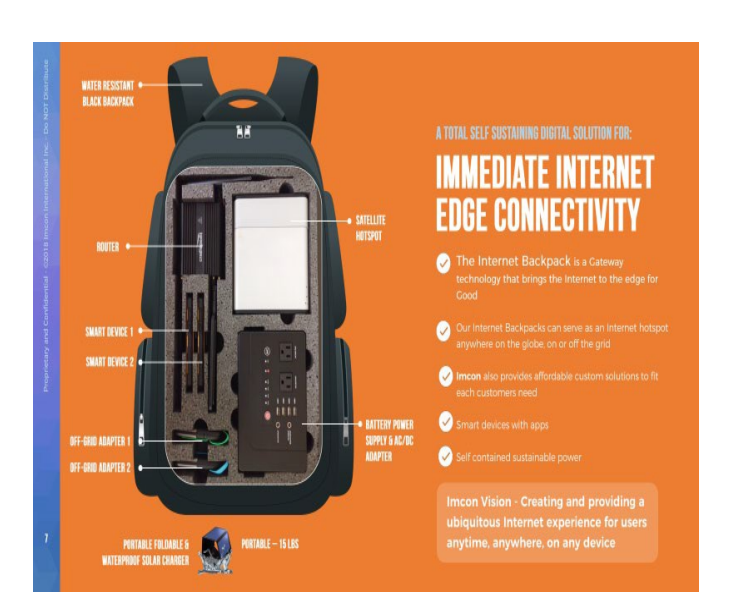
Figure 1. Internet Backpack for Edge Connectivity

satellite, Wi-Fi and GPS. Importantly, the global deployment of the Internet Backpacks also requires a robust cloud-based network management system that can allow its IT or customers' in-house teams to monitor and troubleshoot connectivity challenges remotely.